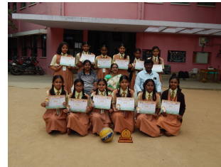
Throw Ball Girls- Runners