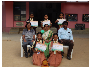
Shuttle Badminton Girls - Winners