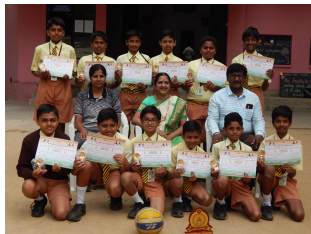
Throw Ball Boys- Runners