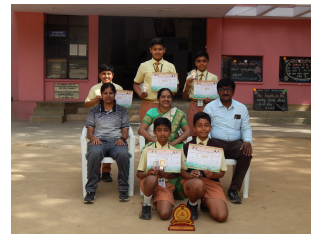
Shuttle Badminton Boys - Winners