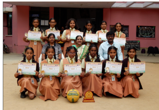
Volley Ball Girls- Winners

Government of Karnataka Departmental Sports conducted Cluster Level Sports which commenced from 26.07.2022.