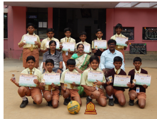
Volley Ball Boys- Winners